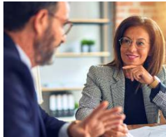
Tax Lien Resolution