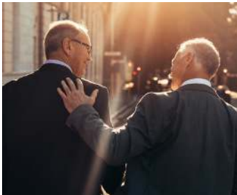
Mergers & Acquisitions